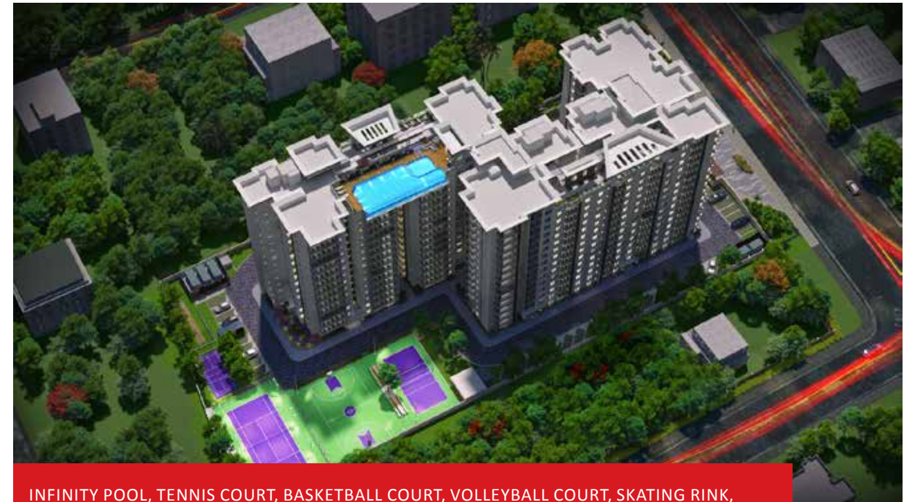
INFINITY POOL, TENNIS COURT, BASKETBALL COURT, VOLLEYBALL COURT, SKATING RINK, CRICKET PITCH AND A WHOLE HOST OF OTHER AMENITIES.

CENTREO BRINGS THE RIGHT COMBINATION OF VARIOUS FACTORS THAT WE THINK ARE IMPORTANT: INTERNATIONAL STYLE IN ITS AESTHETICS, SPACIOUS AND FUNCTIONAL FLOOR PLANS TO TRULY ENJOY ONE'S HOME IN COMFORT, AMENITIES GALORE WITH VERY FEW APARTMENTS SHARING THEM