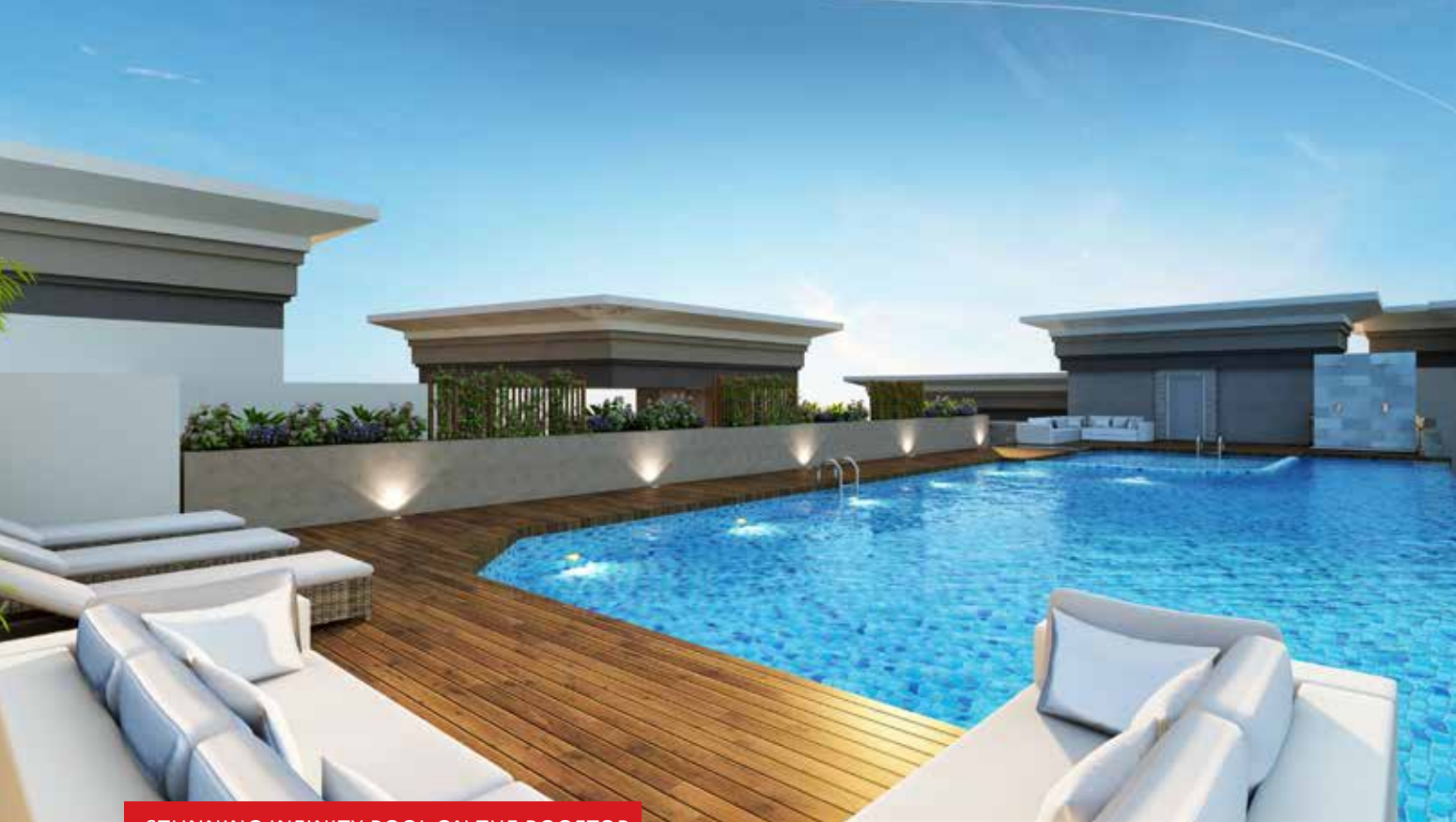
STUNNING INFINITY POOL ON THE ROOFTOP

and work anywhere in Bangalore thanks to its location just 215 meters from the Vajarahalli metro station.