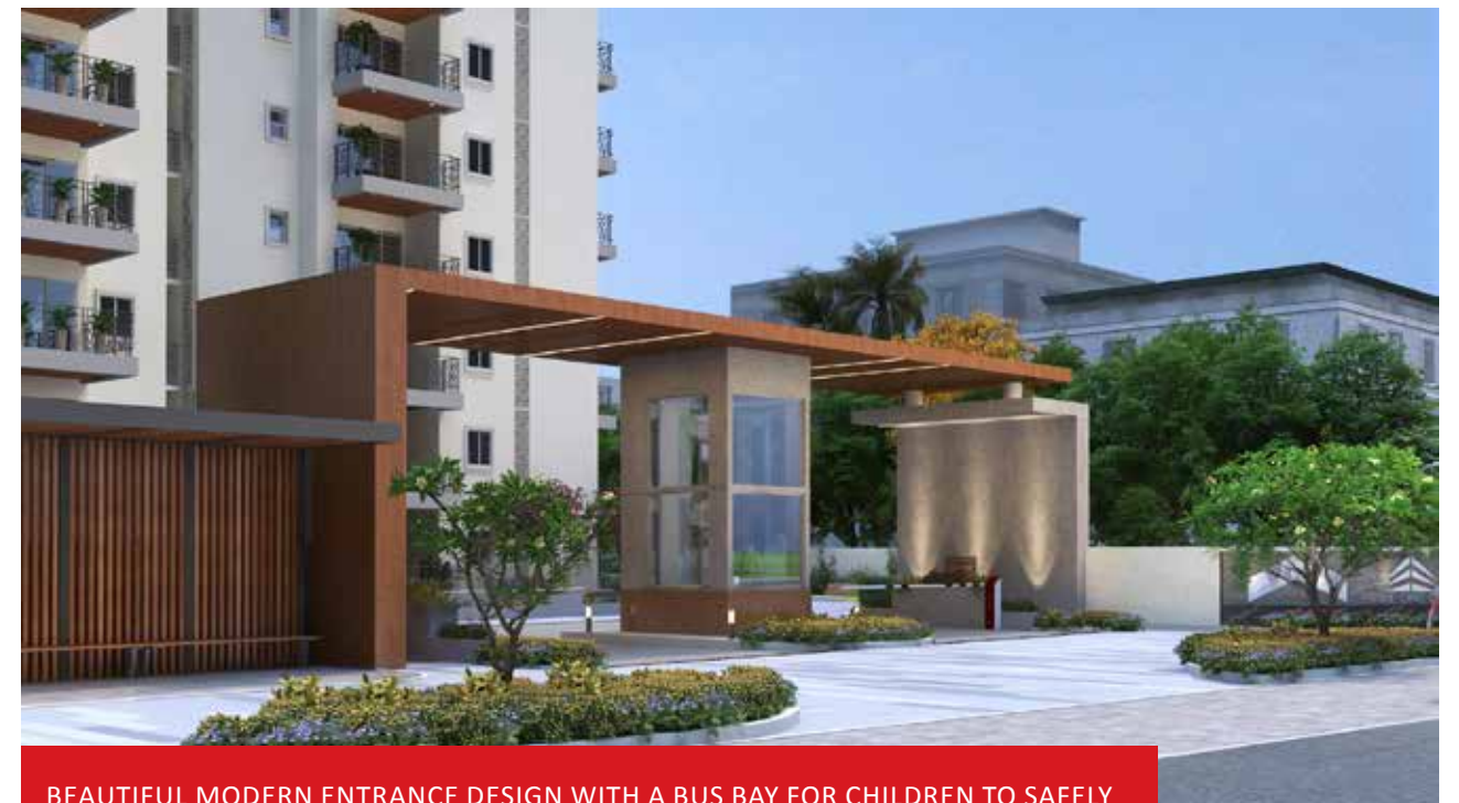
BEAUTIFUL MODERN ENTRANCE DESIGN WITH A BUS BAY FOR CHILDREN TO SAFELY BOARD THE SCHOOL BUS